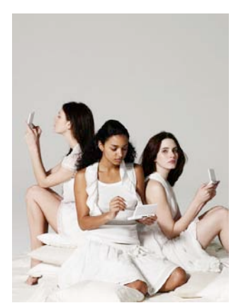
Figure 7: A French ad campaign for the DS Lite.

With the release of games such as Brain Age, Nintendogs and Elektroplankton for the DS, and a whole new interface paradigm along with a range of new game concepts for the Wii, it's clear that Nintendo is moving away from its competitors to open previously untapped markets. The Wii, originally called "Revolution," may in fact truly represent one; it may be as significant as the Model T Ford in creating "videogames for the people." Recent Wii advertising campaigns harkening back to board game packaging of old show a diverse array of players engaging primarily with each other, rather than screenshots showing off graphics, as is the common practice with other systems. (Figure 7) Nintendo, once the undisputed giant of the game industry, has turned its back seat position in the Hegemony of Play into an asset. Rather than racing to create the fanciest graphics with the same old game mechanics, Nintendo has bet on new audiences and accessible game play, cultivating an audience of girls, women, adults and Baby Boomers, in other words, everyone except the "gamer" demographic described above.