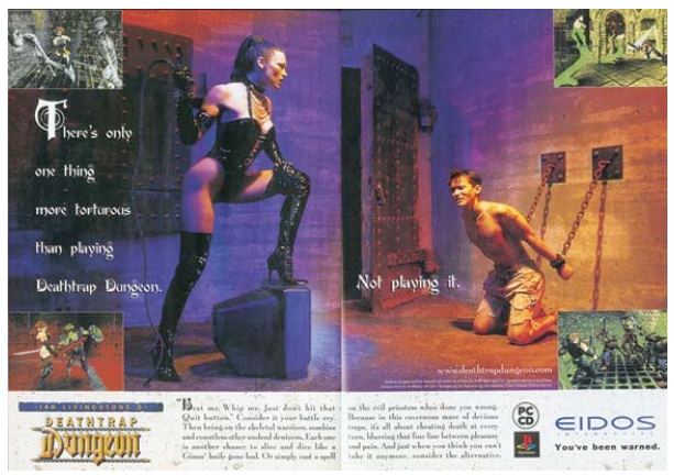
Figure 6: Examples of video magazine game advertisements.

Representation of women is symptomatic of a much larger problem: the games themselves are unwelcoming to those not considered "gamers." Indeed in many respects the digital playground is shut off to "minority" players entirely, whether in terms of game creation, game technologies, or game play, whether merely in terms of creating domains that are exclusively male, or through discriminating or alienating practices of players themselves.