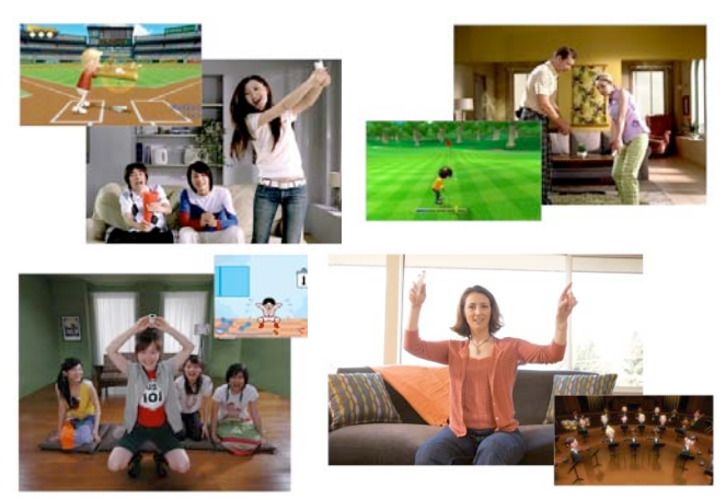
Figure 7: Assorted pre-release ads for the Nintendo Wii.

With the release of games such as Brain Age, Nintendogs and Elektroplankton for the DS, and a whole new interface paradigm along with a range of new game concepts for the Wii, it's clear that Nintendo is moving away from its competitors to open previously untapped markets. The Wii, originally called "Revolution," may in fact truly represent one; it may be as significant as the Model T Ford in creating "videogames for the people." Recent Wii advertising campaigns harkening back to board game packaging of old show a diverse array of players engaging primarily with each other, rather than screenshots showing off graphics, as is the common practice with other systems. (Figure 7) Nintendo, once the undisputed giant of the game industry, has turned its back seat position in the Hegemony of Play into an asset. Rather than racing to create the fanciest graphics with the same old game mechanics, Nintendo has bet on new audiences and accessible game play, cultivating an audience of girls, women, adults and Baby Boomers, in other words, everyone except the "gamer" demographic described above.