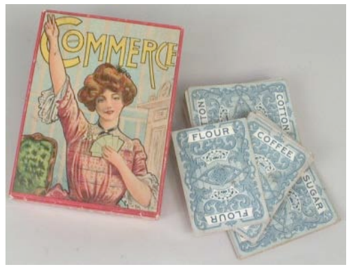
Figure 3: Commerce (Ottoman & Lith 1900)

While the people represented on the boxes of these games were generally white and middle class, they spanned both genders and a wider range of ages than do typical video game packaging and ads of today. The convention of showing people playing the game used on the packaging of the period provides some insight into the way in which the "technology" of the board games influenced their players and their role in society. The Sociable Telephone—A Game for the Smart Set, designed to teach etiquette for the new communications technology, features a smiling Victorian lady (Parker Bros. 1902); and the box cover for the stock market game Commerce shows a woman holding a trading card high up in the air. (J. Ottoman & Lith 1900) (Figure 3) Ads for Pillow-Dex, an indoor sport utilizing a kind of balloon, show Victorian ladies in full regalia knocking the object into the air. (Parker Bros. 1897) [18] (Figure 4) While there are currently no videogames based on women's sports, the board game industry of over 100 years ago, in recognition of the game's popularity among both men and women, created The Game of Basket Ball with an all-female cast. (Chaffee & Selchow & McLoughlin Bros. 1898) [8]