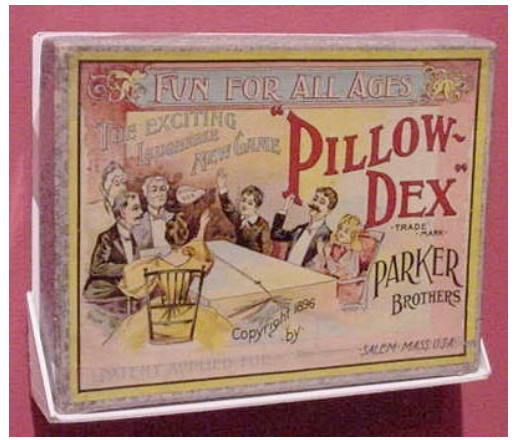
Figure 4: Typical of packaging of the day, Pillow-Dex shows multiple generations enjoying the game.

One of the most intriguing and little-known aspects of the early board game industry was the predominance of women in the production process. The following account, from The Game-Makers , a history of Parker Brothers, sets the stage for what would come to be called "The Pastime Girls," after Pastime Puzzles, the jigsaw division of the company [18]: